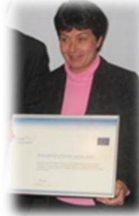
The mayor of Varese Ligure receiving the eea® award in 2005

» In the Municipality of Varese Ligure, we have tried the eea® tool in the year 2005 within a project called EURENA. I can say that the eea® brought to our municipality a stronger knowledge on energy planning issues and is a good method for citizens involvement«